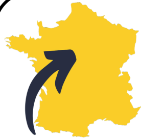
La Queue en Brie